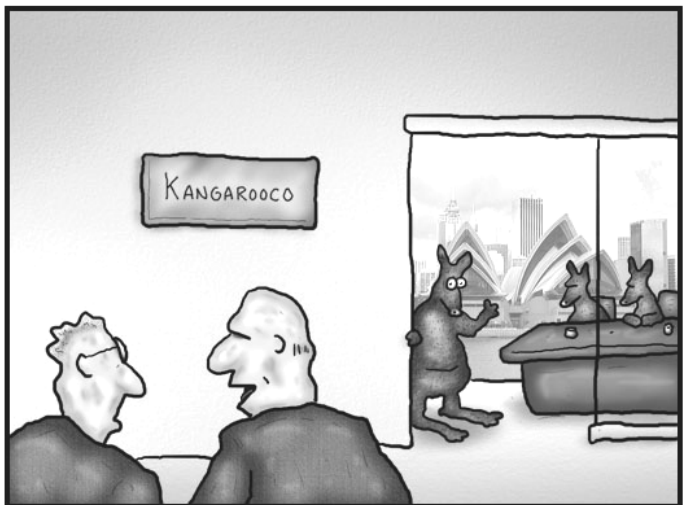
"These guys have deep pockets."

The Taco Bell Chihuahua, a Doberman and a Bulldog are in a bar having a drink when a great-looking female Collie comes up to them and says, "Whoever can say liver and cheese best in a sentence can have me." So the Doberman says, "I love liver and cheese." The Collie replies, "That's not good enough." The Bulldog says, "I hate liver and cheese." She says, "That's not creative enough." Finally, the Chihuahua says, "Liver alone . . . cheese mine."