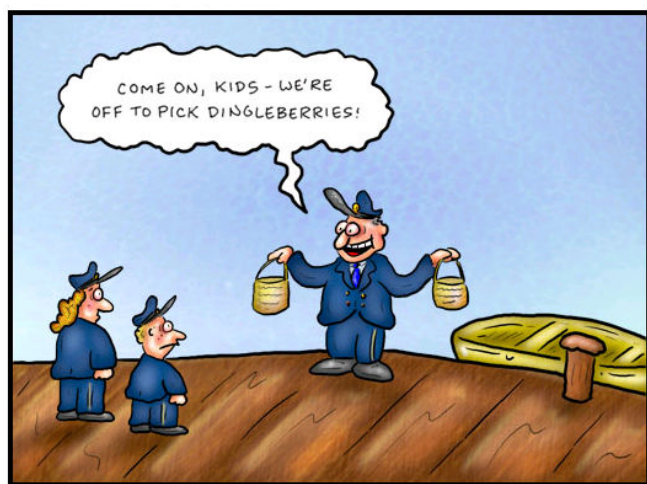
"Take Your Kids to Work" Day with the Tidy Bowl Man