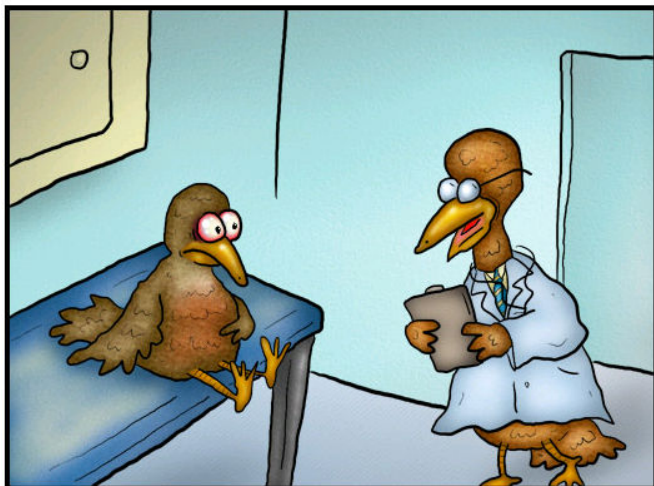
"It's a good thing you got to us early. You've got worms."

Just in case you've had a rough day, here is a stress management technique recommended in all the latest psychological texts, the funny thing is that it really works! Picture yourself near a stream. Birds are softly chirping in the cool mountain air. No one but you knows your secret place. You are in total seclusion from the hectic place called "the world." The soothing sound of a gentle waterfall fills the air with a cascade of serenity. The water is crystal clear. You can easily make out the face of the person you're holding under water!