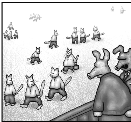
"If we held free elections they'd just elect a cat."

An old maid wanted to travel by bus to the pet cemetery with the remains of her cat. As she boarded the bus, she whispered to the driver, "I have a dead pussy." The driver pointed to the woman in the seat behind him and said, "Sit with my wife. You two have a lot in common."