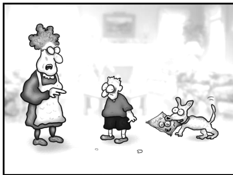
"Everytime you masturbate, God kills a kitten."

While in the playground with his friend, Little Johnny noticed that Jimmy was wearing a brand new, shiny watch. "Did you get that for your birthday?" asked Little Johnny. "Nope." replied Jimmy. "Well, did you get it for Christmas then?" Again Jimmy says "Nope." "You didn't steal it, did you?" asks Little Johnny.